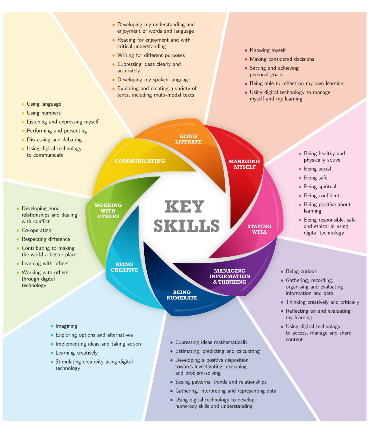
Figure 1: Key skills of junior cycle

In addition to their specific content and knowledge, the subjects and short courses of junior cycle provide students with opportunities to develop a range of key skills. The junior cycle curriculum focuses on eight key skills.