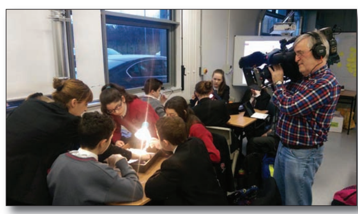
Making teaching strategy videos.

http://www.curriculumonline.ie/Junior-cycle/Junior-Cycle-Subjects/Business-Studies